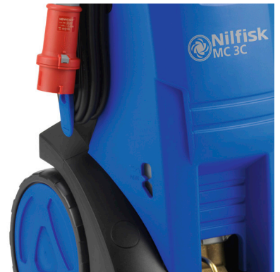
The turnable cable hook makes winding and unwinding of the electrical cable child's play.